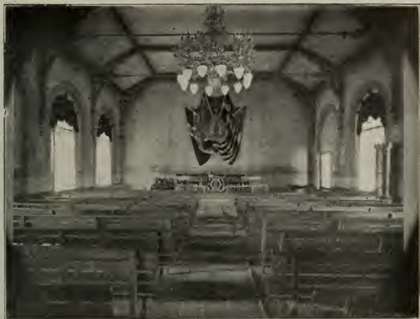
INTERIOR OF THE ASSEMBLY HALL, LATTER-DAY SAINTS' MISSION HOUSE, CHRISTIANIA, NORWAY.